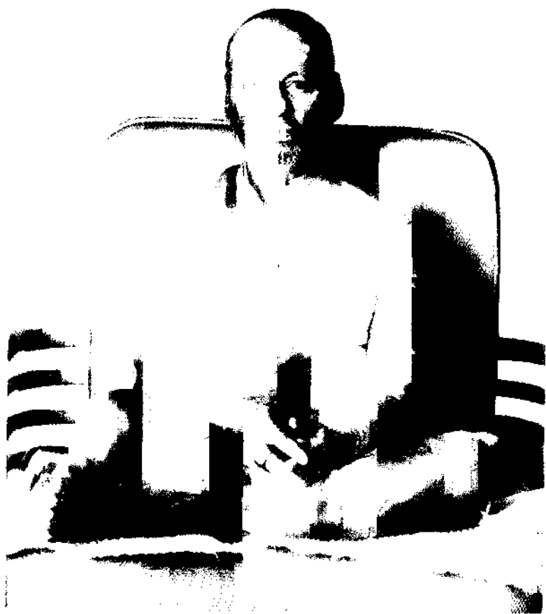
Sadguru Swami Muktananda