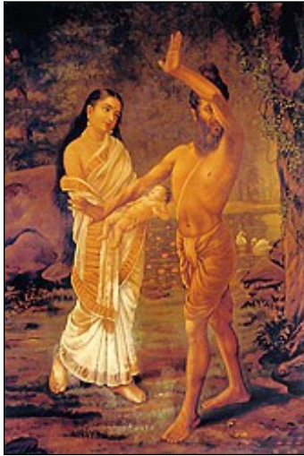
Buy this Reprint

VISHWAMITRA REJECTS MENAKA AND THEIR DAUGHTER