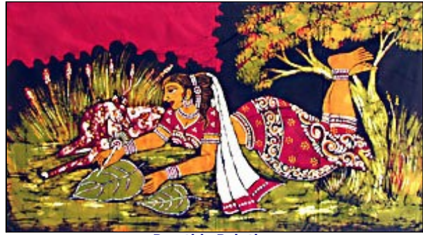
Buy this Painting

After Dushyanta's departure from the ashram, Shakuntala spent much time dreaming about him and was often in her own dream world, neither eating nor sleeping properly. One day, rishi Durvasa, who was infamous for his nasty temper, came to the ashram. Lost in her thoughts, Shakuntala failed to notice the sage and greet him properly.