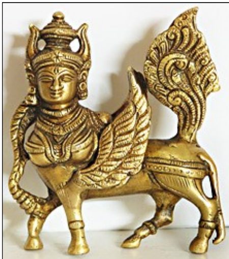
Buy this Statue