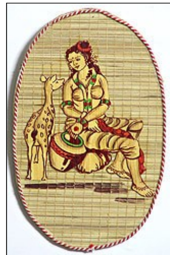
Buy this Wall Hanging

So gentle and soft-spoken was she, that even the birds and animals residing in the forest were drawn to her. In fact, Shakuntala is often portrayed petting deer, who are considered to be some of the most timid animals, fearing all human contact.