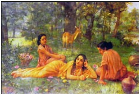
Buy this Reprint

Understanding Shakuntala's state and realizing that she was truly innocent; Durvasa modified his curse saying that the person who had forgotten Shakuntala would recall everything if she showed him a personal token of love that had been given to her.