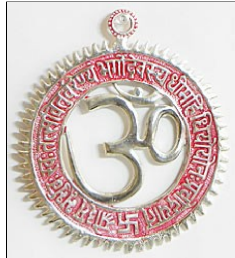
Buy this Wall Hanging

Vishwamitra, a descendant of the mighty King Kusha (not Lord Rama's son), was also called Kaushika. He was originally a king of ancient India. Vishwamitra ruled the earth for many thousands of years. The story of Vishwamitra appears in various Puranas, with slight differences in each one of them. He was the son of Gadhi, one of the four sons of Kusha.